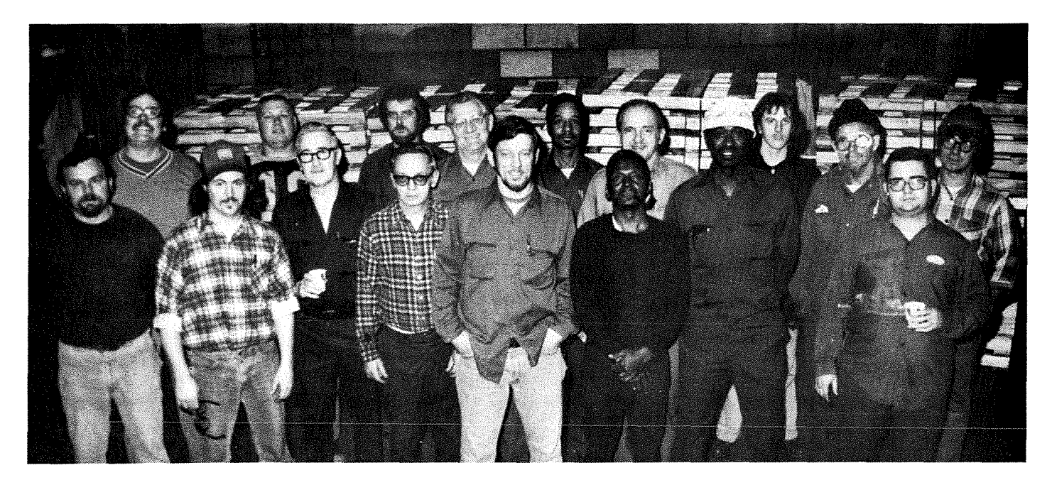
First place in the Safety First contest for the month of May was won by TEAM 9. This team is comprised of second shift personnel from Areas 1541, Superintendent's Office; 1543, Production Plant 2; 1546, Metal Engineering.

EXPERIENCE is not what happens to a man. It is what a man does with what happens to him. — Aldous Huxley